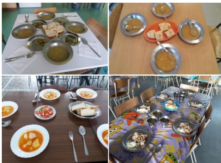
Picture 5. Table settings in four schools