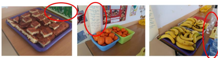
Picture 6. Dessert serving in PS Ljuba Nenadović

In picture no. 6, a dessert arrangement in PS Ljuba Nenadović is depicted. It should be noted that the cakes are accompanied by juice-boxes which are arranged behind the tray with the cakes and are, thus, less accessible to the children (red circle in the left-hand picture). In contrast, fruit (bananas) is served with water, poured into plastic cups and made readily available to the children (red circle in the right-hand picture). The middle picture shows that the dining ambient is enriched with healthy food-related posters containing written recommendations for food consumption (red circle in the middle picture), such as: a lot of water should be drunk, each meal should be followed by a brief 10-15 min walk, food should be enjoyed and eaten in a relaxed atmosphere, etc.