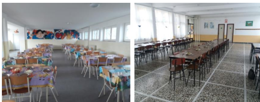
Picture 1: PS Gavriilo Princip vs. PS Ljuba Nenadović - dining rooms

The first determinant considered was the kitchenscape, representing the location in which the food is made and ingested. It can be observed in picture no. 1 that the eating facilities in PS Gavriilo Princip are much more child-friendly than those in PS Ljuba Nenadović. In the former, the tables are covered with colorful, cartoon-inspired tablecloths, while the latter has brown, uncovered and unappealing tables. Even though the furniture size in both schools is adjusted to accommodate chil-