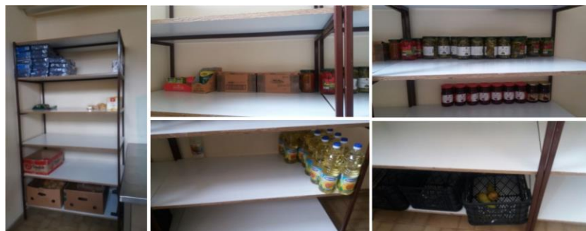
Picture 2. PS Pavle Savić - storage facilities