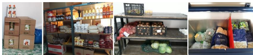
Picture 3. PS Gavriilo Princip - storage facilities