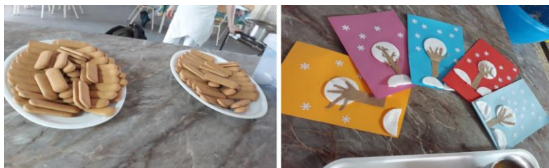
Picture 7. Dessert serving in PS Gavriilo Princip