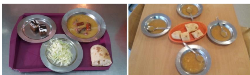
Picture 4. Tray with a main course and soup set on the table in PS Dositej Obradović

In the following stage of our analysis, we turn our attention to tables, or the appearance of the tables on which the food is served and consumed. As previously cited, in the school context, it is especially relevant whether the food is served on trays or whether it is served on the tables. Even though the soup is served on the tables in PS Dositej Obradović (picture 4), according to the cooks, children usually do not like this type of food, and 10-15% of them immediately return it and go and stand in line to get the main course on a tray. This finding contradicts the results of García-Segovia, Harrington and Seo (2015).