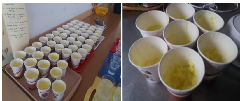
Picture 10. Leftovers of pudding served in paper cups